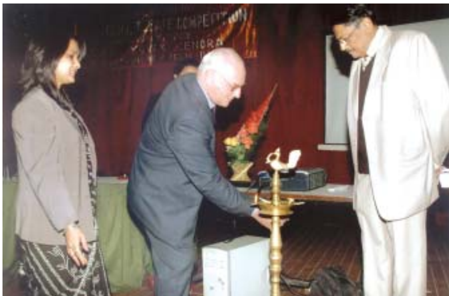
Lighting the thoughts

To commemorate the National Youth Day, Vishwa Yuvak Kendra organised an Inter-School Debate on 12 January 2008. The topic for the debate was, “Do parents have any right in deciding their child’s future?”