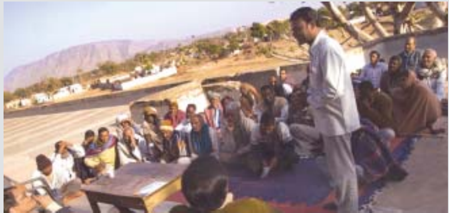
Initiating development from the grass-root

Entrepreneurship Development Programme 7-11 February 2008